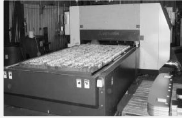
Plate & Sheet Metal Processing

7- CNC Plate Lasers: 1" Mild Steel & 3/4" Stainless